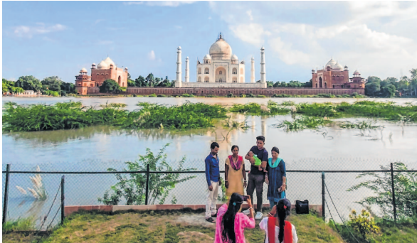
Visitors pose for pictures near the swollen Yamuna river during monsoon season, near Taj Mahal in Agra

Floodwaters have already inundated the protected monument Etmad-ud-Daula, where 12 chambers at the rear side are